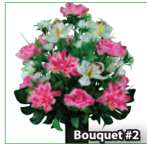
Pink w/ White Orchid Mix