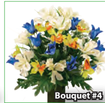
Blue Tulips & Yellow Orchid Mix