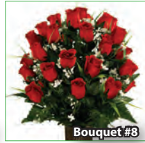
Red Roses AVAILABLE in May