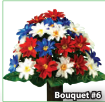
Red White & Blue Dahlia