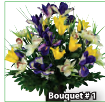
Yellow Tulips and Purple Iris