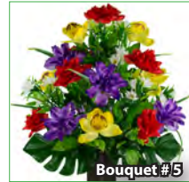
Red, Purple & Yellow Orchid Mix