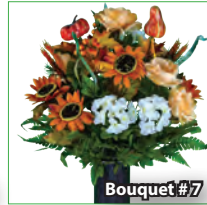
Auburn Sunflower & Pumpkin Mix