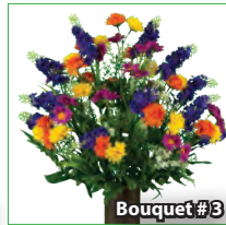
Purple Violet Yellow Wildflower Mix